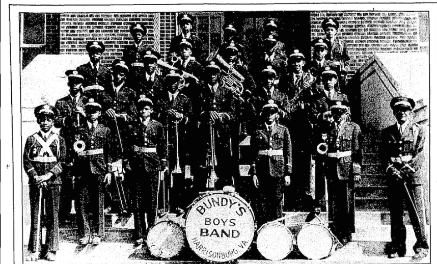
The award-winning Bundy's Boys Band in full marching regalia.

12 DAILY NEWS-RECORD, Harrisonburg, Va., Thursday, Feb. 24, 1994